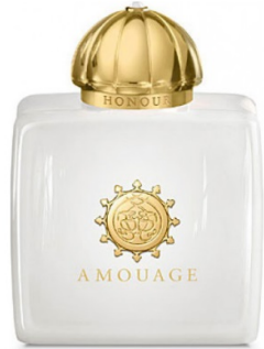
Amouage – Honour