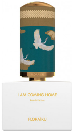
I am Coming Home

Scent: Ginger Oil, White Tea Oil, Cardamom Oil