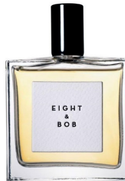
Eight & Bob Original

Scent: Pine Tree, Russian Leather, Mint Retail: $300 Your Price: $200