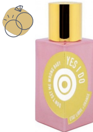
Yes I Do

Scent: Lily, Jasmine, Patchouli, Cocoa, Marshmallow