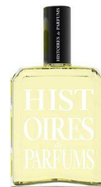
Histoires - 1899

Scent: Bergamot, Vetiver, Juniper, Vanilla