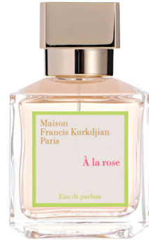
A La Rose