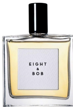
Eight & Bob Original