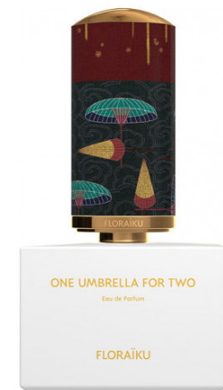
One Umbrella For Two

Scent: Blackcurrant Absolute, Genmaicha Tea, Cedar Oil