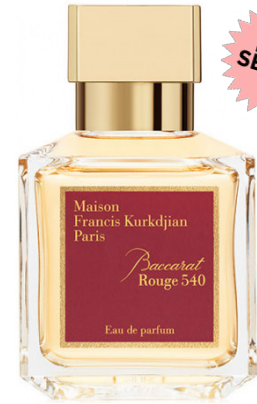
Baccarat Rouge 540