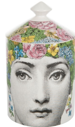
Fornasetti- Flora Candle

Scent: White Florals, Orange Blossoms, Sandalwood